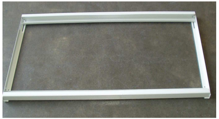
STEP 7: ENSURE THE POSITION OF THE SCREW AS SHOWN IN THE ABOVE PICTURE (ADJUSTABLE END OF THE SHORT MEMBER)