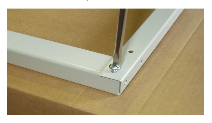
STEP 4: ASSEMBLE THE OTHER SHORT MEMBER WITH THE OTHER END OF THE SAME LONG MEMBER USING SCREW