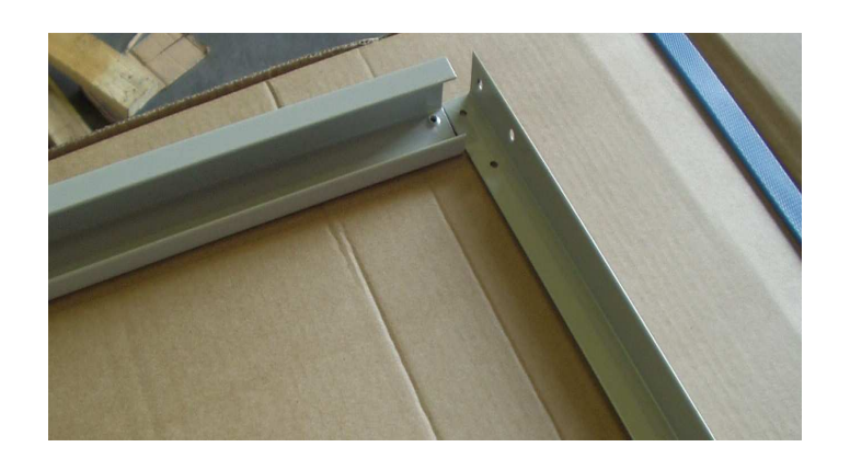
STEP 3: ASSEMBLE THE FIX END OF THE SHORT MEMBER WITH LONG MEMBER USING SCREW