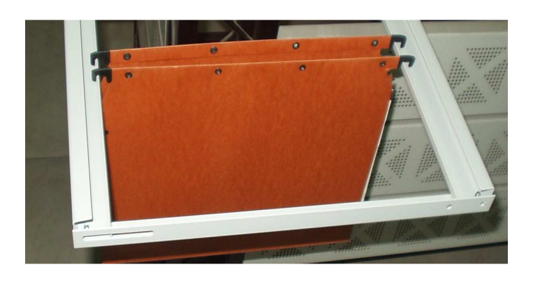
STEP 9: MOUNT THE FILING FRAME IN THE CUPBOARD USING SHELF CLIPS AS PROVIDED AT FOUR CORNERS