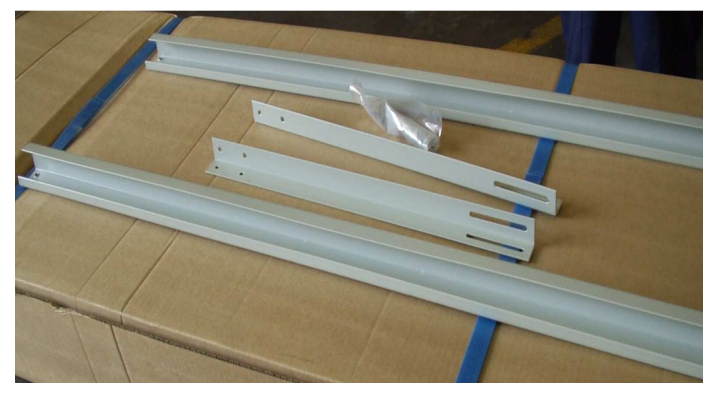
STEP 2: CHECK FOR THE AVAILABILITY OF PARTS (2 LONG MEMBERS & 2 SHORT MEMBERS AND ONE PACKET OF SCREWS)