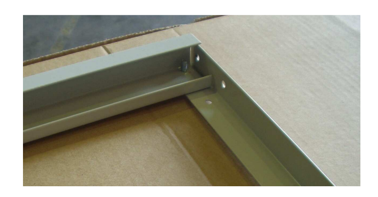
STEP 6: ENSURE THE POSITION OF THE SCREW AS SHOWN IN THE ABOVE PICTURE (FIX END OF SHORT MEMBER)