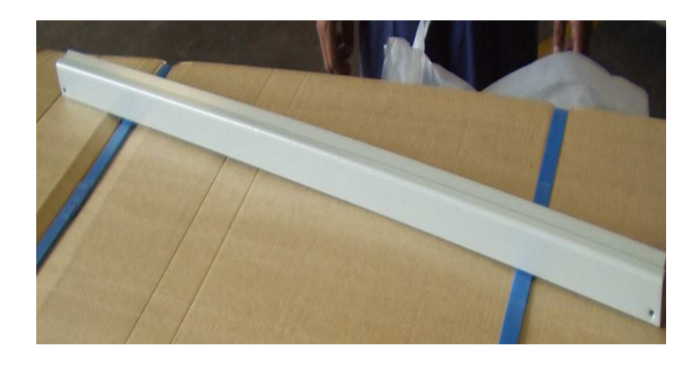
STEP 1: OPEN THE FILING FRAME PACKET